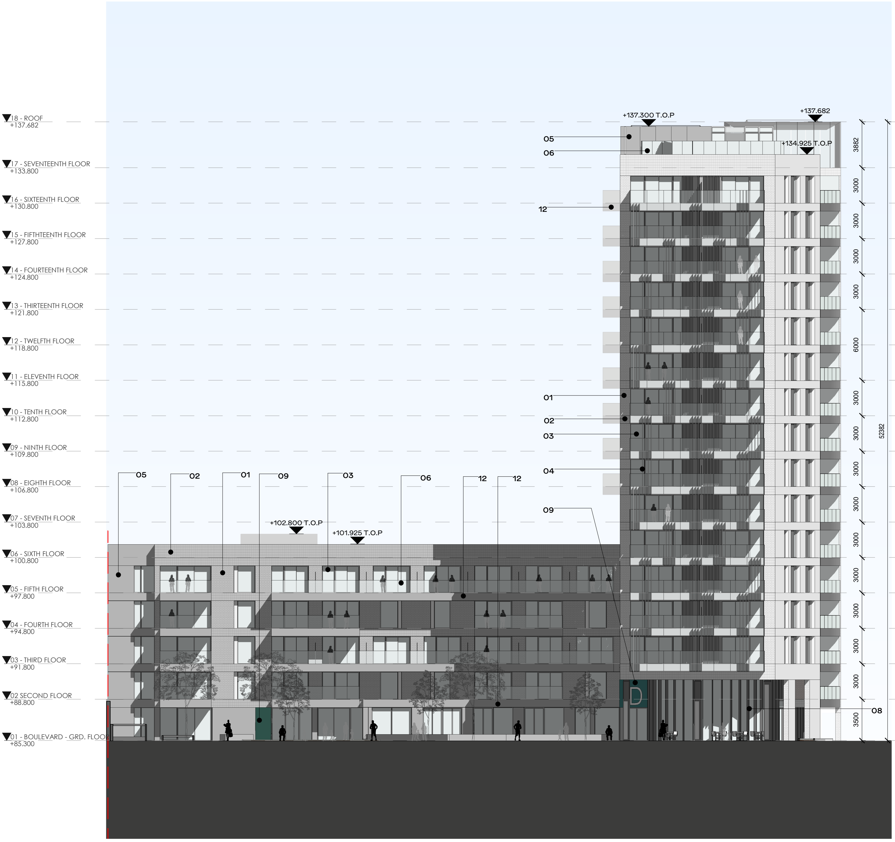
2 BLK C & D South West Elevation 1:200