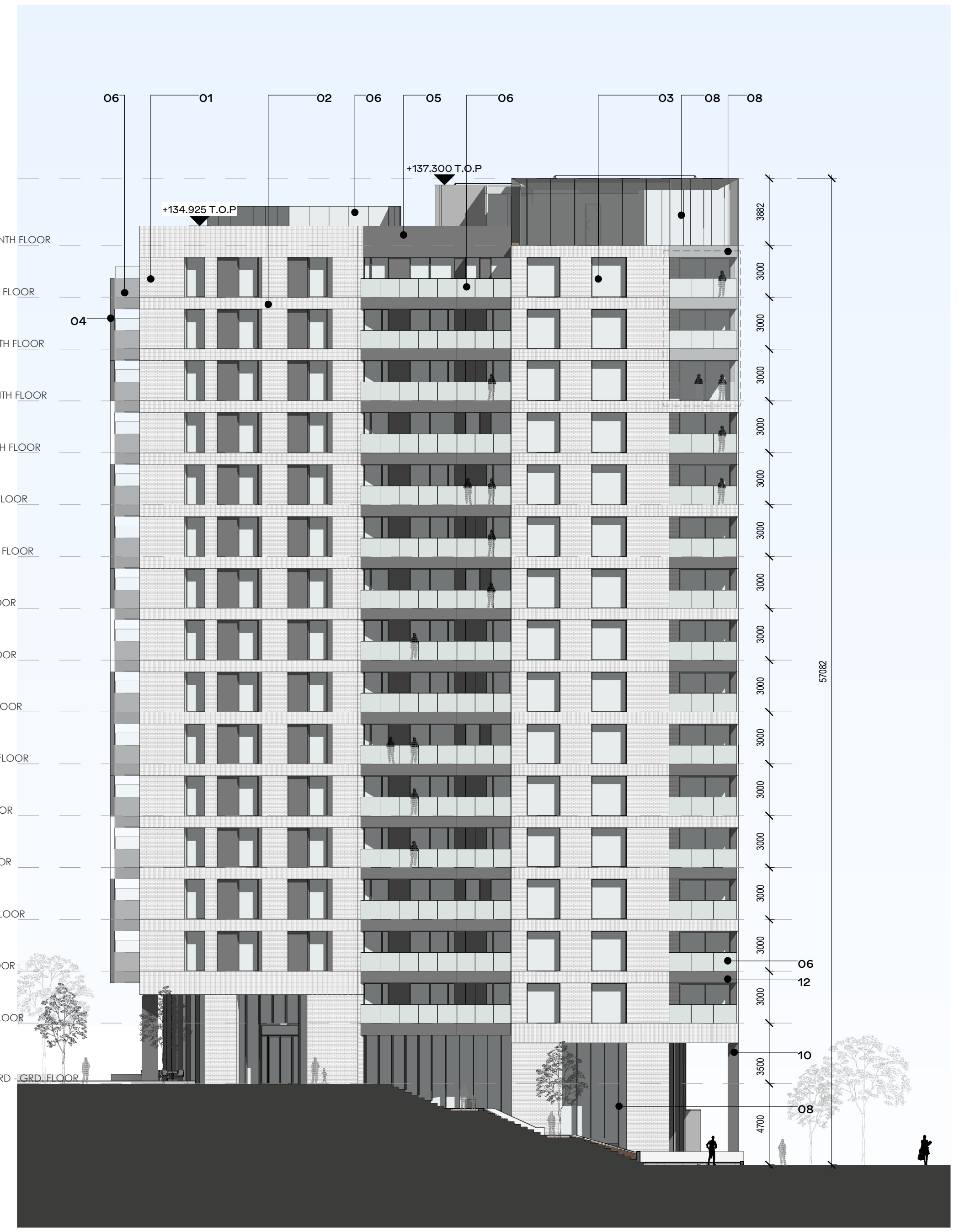
1 BLK C & D South East Elevation 1:200

Architecture + Interiors henrylyons.com +353 1 888 3333 info@henrylyons.com 51-54 Pearse Street Dublin D02 KA66